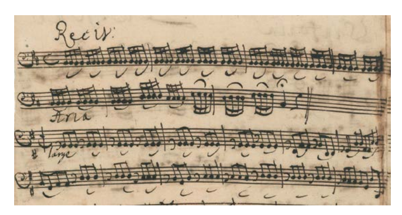
Figure 5.Detail from the bassoon part of BWV 42.

survive that discuss the use of vibrato on the bassoon. However, plenty of treatises speak about vibrato on other wind instruments, such as the recorder and the flute. These ideas likely still apply to our instrument since most wind players from the time were skilled on a variety of instruments, including the bassoon.