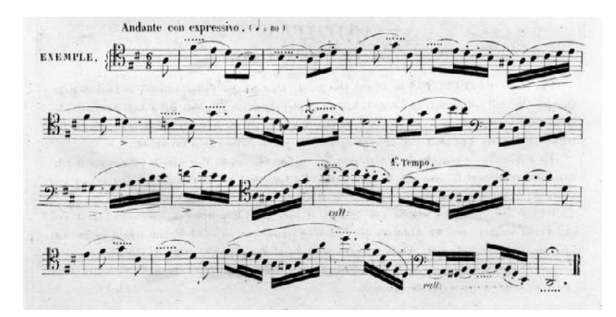
Figure 11. Eugène Jancourt, "Andante con expressivo," with vibrato indicated by dots.

Jancourt included a musical example, "Andante con expressivo," in which he indicates the use of vibrato on long notes indicated by dots.